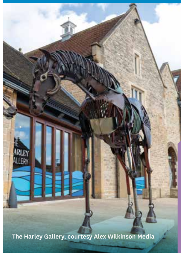
The Harley Gallery

Please vote 'YES' for the North Notts journey to continue