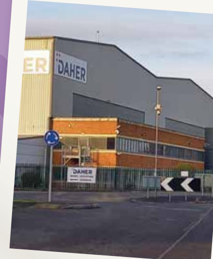
Installed CCTV with ANPR into our industrial areas