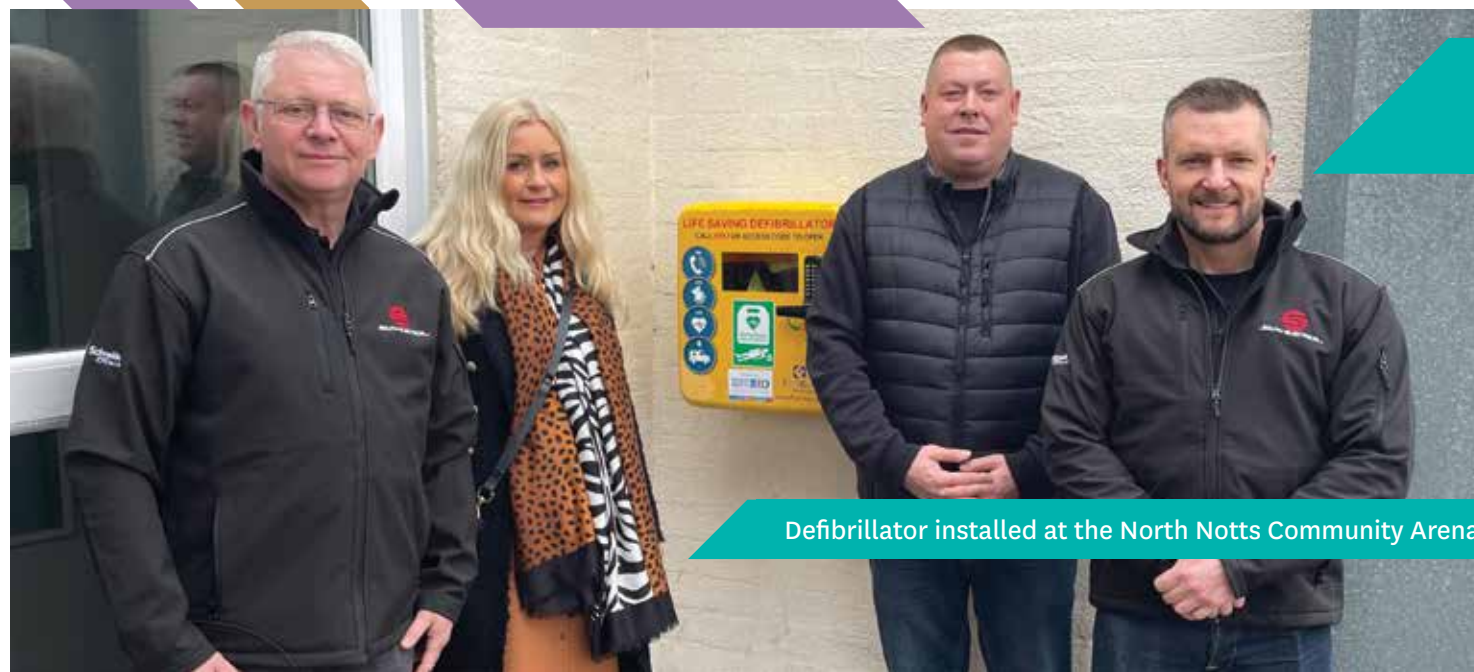
Defibrillator installed at the North Notts Community Arena

As we continue to emerge from the effects of the pandemic, we want to help our businesses in as many different ways as we can, from staffing and workforce to promotion and marketing. And we will further enhance our business crime reduction offer to secure the future of North Notts.