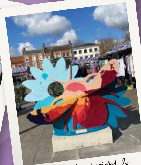
Created a bright & welcoming atmosphere for our town centres