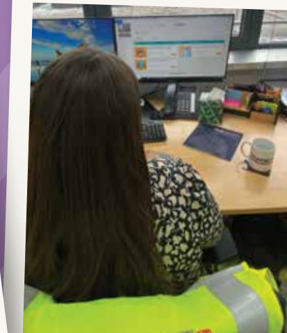
Developed a new FREE digital training platform