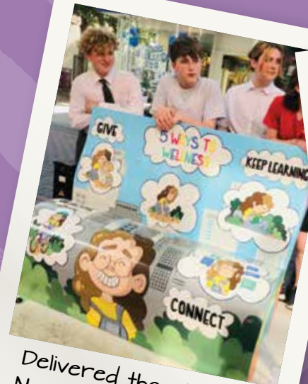
Delivered the stunning North Notts Journeys Art Trail