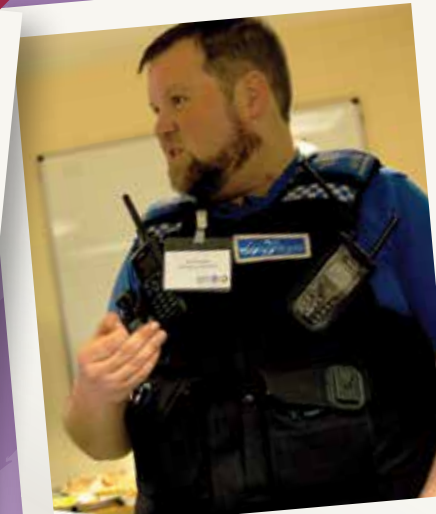
Enhanced our Business Crime focus with NNBCRP