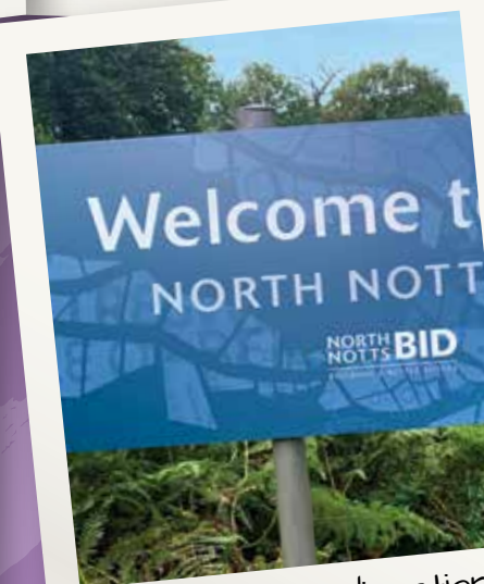
Refreshed the directional Signage welcoming people to North Notts