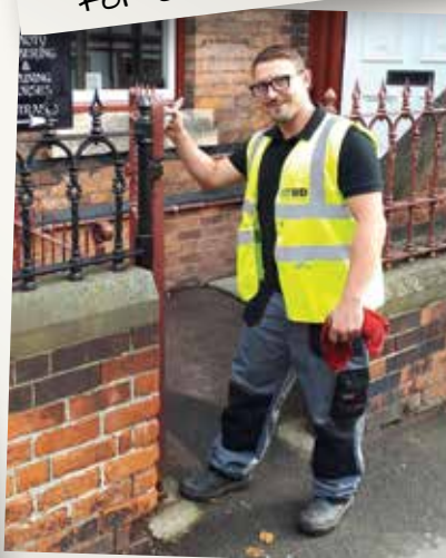
Tidied up with our Maintenance Support Service