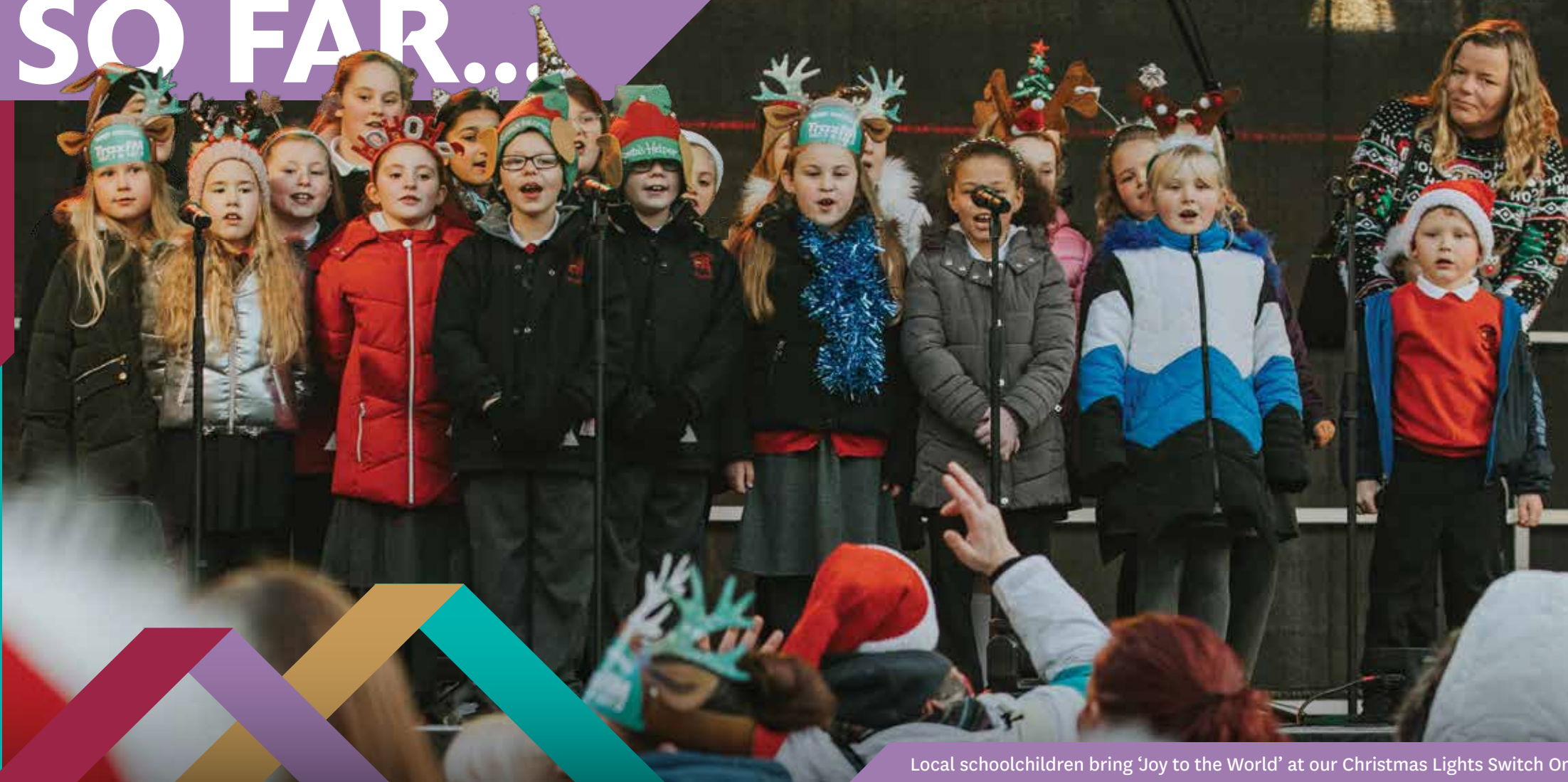
Local schoolchildren bring 'Joy to the World' at our Christmas Lights Switch On

Helping our business community to thrive has been at the heart of everything we have done for the last five years.