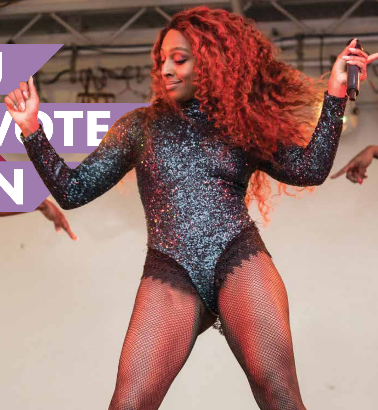
Alexandra Burke wows in front of big crowds at Retford's Party In The Square

We secured more than £3.7m in funds to support our business community since an overwhelming 85% voted 'YES' to a BID for North Nottinghamshire. This is an additional £500k on top of the forecasted £3.2m outlined in our first business plan.