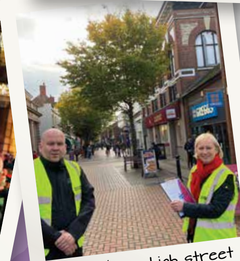
Helped our high street reopen after the pandemic