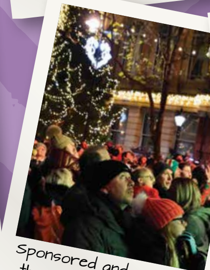
Sponsored and managed the popular Christmas Lights Switch On