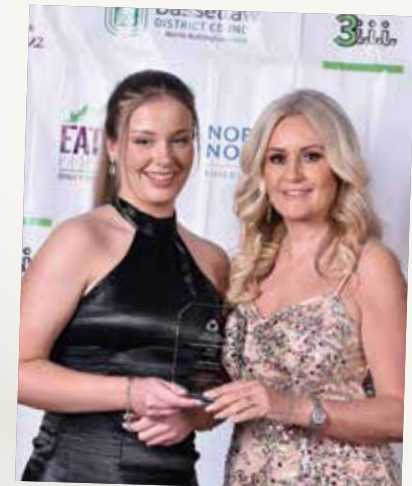
Sponsored the inspiring North Notts Business & Business Women Awards