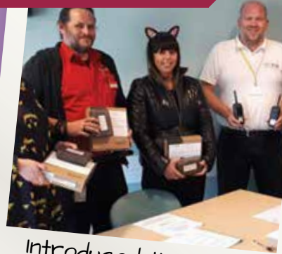
Introduced the DISC crime reporting app & FREE digital radios

For all of this to continue you must vote YES at the ballot taking place between the 2 nd June and the 30 th June!