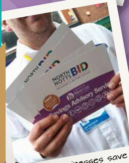
Helped businesses save with the North Notts Savings Service