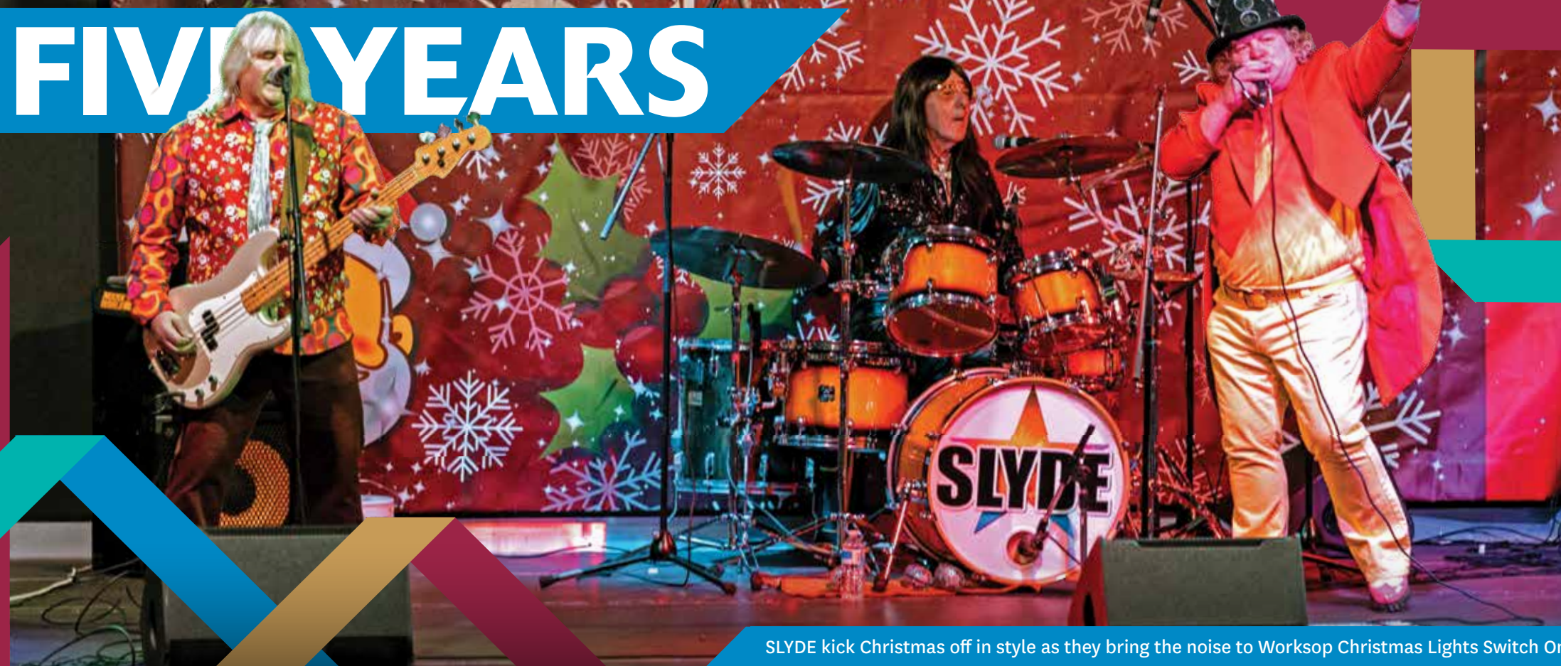
SLYDE kick Christmas off in style as they bring the noise to Worksop Christmas Lights Switch On

We pledge to keep up the momentum and make further strides in our transformation over the next five years with many fresh and exciting plans in the pipeline.