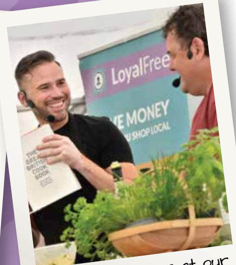
Hosted big names at our showcase events which thousands came to see