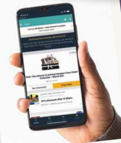
Introduced the LoyalFree App for offers & savings