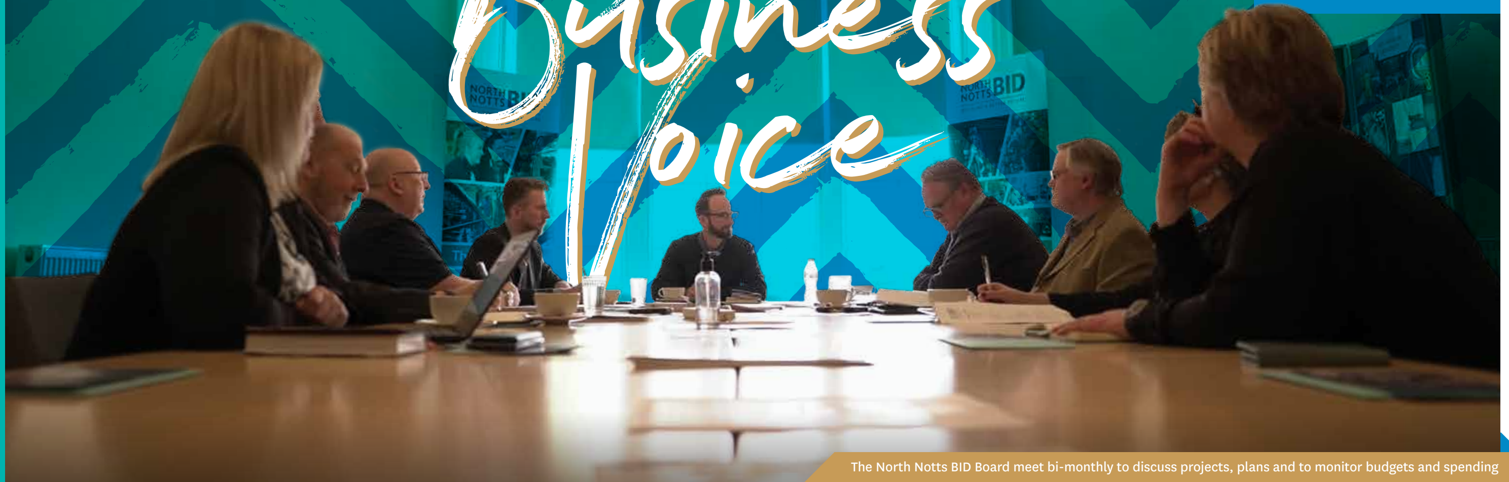
The North Notts BID Board meet bi-monthly to discuss projects, plans and to monitor budgets and spending

Combining rich history and an exciting future, North Nottinghamshire is a great place to do business. We have many home-grown companies and multi-nationals, and small independent businesses in our town centres, historic country estates and industrial estates.